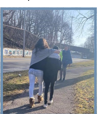
Going on walks in your community, supporting one another by being a friend and sometimes a person to wrap an arm around. (Picture 5)